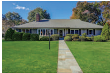
2231 Edgewood Terrace Scotch Plains $665,500

www.coldwellbankerhomes.com/id/32403003 Emanuel "Lyle" Brewster 908.233.5555