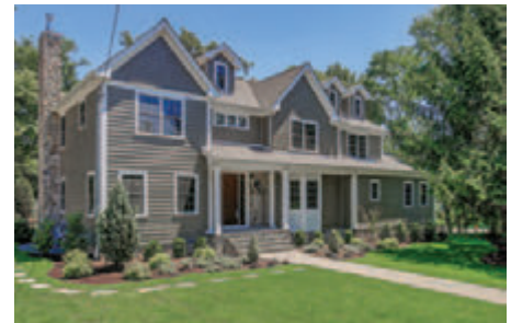
110 Wychwood Road Westfield $1,395,000

TheSoldiCollection.com Frank D. Isoldi 908.233.5555 x202