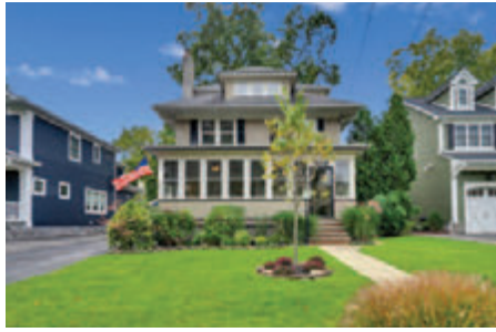
765 Clark Street Westfield $689,000

www.coldwellbankerhomes.com/id/3375102 Irene Katz 908.233.5555