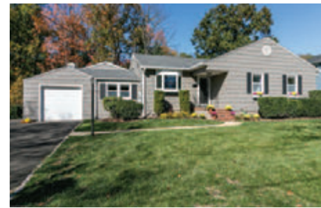
1957 Mary Ellen Lane Scotch Plains $569,000