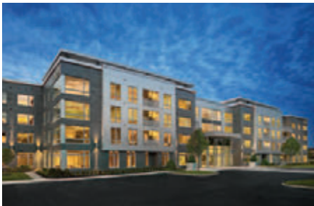
90 Park Avenue Florham Park