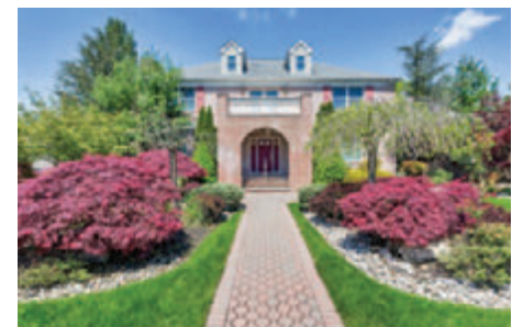
6 Pavlocak Court Edison $1,100,000

www.coldwellbankerhomes.com/id/31861941 Virginia Garcia 908.233.5555