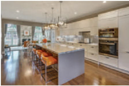
1490 Route 22 West Mountainside Leasing Now at $4,500

Alpine Ridge Boutique Homes. Townhomes for active adults 55+. Specifically designed to appeal to today's discerning homebuyers. Just 2 miles from downtown Westfield for shopping and dining.