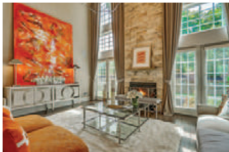
1490 Route 22 West Mountainside Leasing Now at $4,500

www.coldwellbankerhomes.com/id/32487636 Frank D. Isoldi 908.233.5555