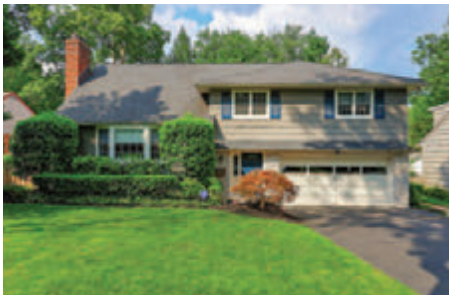
631 S. Chestnut Street Westfield $899,999

TheSoldiCollection.com Frank D. Isoldi 908.233.5555 x202