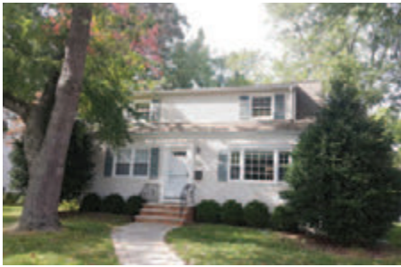
27 Poplar Place Fanwood $485,000

Move right in to this meticulously maintained 4BR Cape in a lovely neighborhood w/new wood floors on 2nd flr and new paver patio / front walkway.