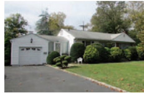
271 Summit Road Mountainside $444,900

www.coldwellbankerhomes.com/id/32652935 Naasa Sherbeini 908.233.5555