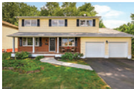
910 Orange Avenue Cranford $549,000

www.coldwellbankerhomes.com/id/33716224 Virginia Garcia 908.233.5555