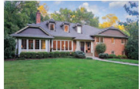
820 Lawrence Avenue Westfield $1,625,000