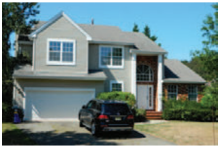
1 Woodmere Court Old Bridge $540,000

www.coldwellbankerhomes.com/id/32982222 John Papa 908.233.5555