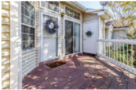
76 Sage Court Bedminster $260,000

Better than new! Pristine, well-maintained Mayfield "B" Penthouse Unit with high ceilings and open floor plan.