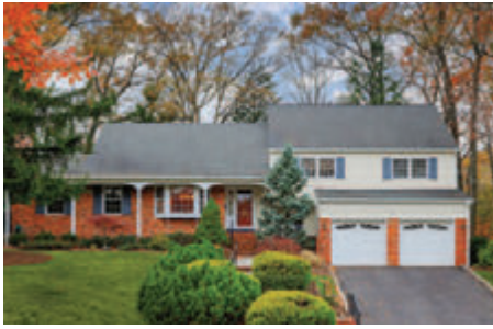
16 Burrington Gorge Westfield $865,000

Wonderful custom split-level home on a lovely tree-lined street features beautiful wood floors, inviting 1st flr FR w/gas fireplace, expansive LR and FDR flow into large, open kitchen.