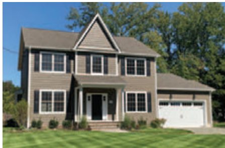
1115 Summit Avenue Westfield $1,299,900

www.coldwellbankerhomes.com/id/32399992 Kristen Lichtenthal 908.233.5555