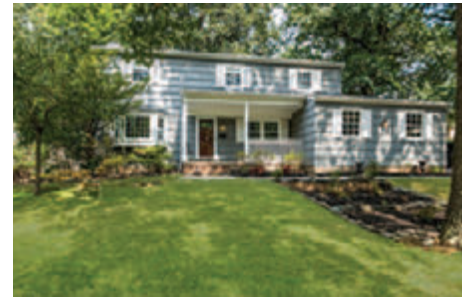
70 Willoughby Road Fanwood $614,000

www.coldwellbankerhomes.com/id/31119473 Gina Suriano Barber 908.233.5555