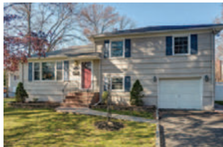
101 Glenwood Road Cranford $439,000

www.coldwellbankerhomes.com/id/33721031 John Papa 908.233.5555