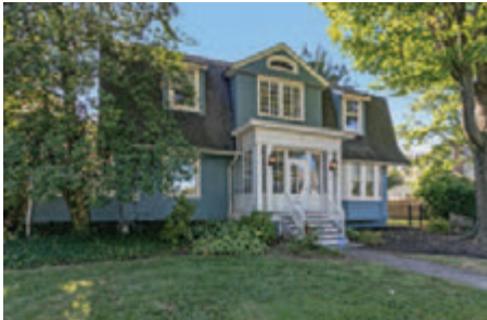
652 Fairfield Circle Westfield $920,000