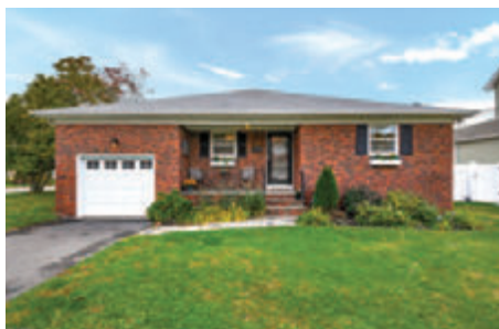
590 Ludlow Avenue Cranford $539,000