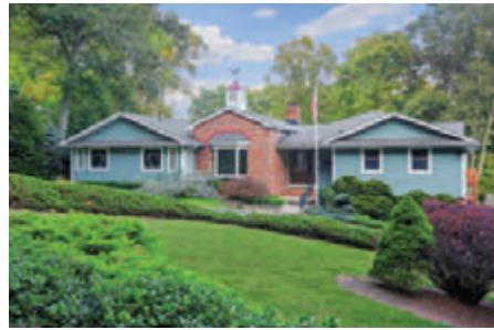
400 Summit Road Mountainside $749,000

alpineridgemountainside.com 732.710.3839