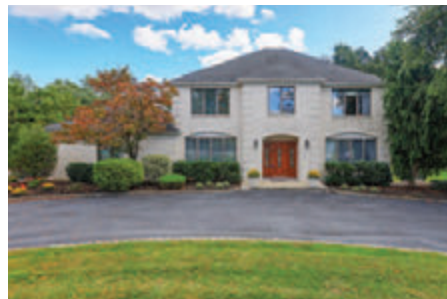
8 Winchester Drive Scotch Plains $849,000

www.coldwellbankerhomes.com/id/33932522 Jill Horowitz Rome 908.233.5555