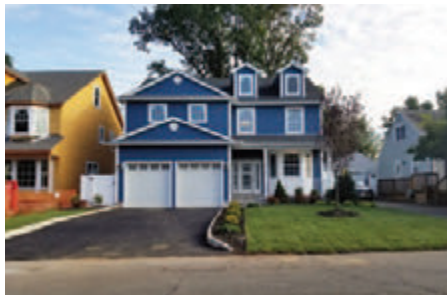
641 Passaic Avenue Kenilworth $649,900

Gorgeous new 4BR Colonial! The master craftsmanship is evident throughout this large 3300 sq ft home from the spa-like marble master bath to the custom gourmet kitchen.