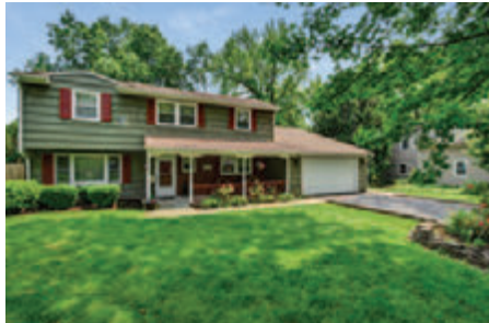
121 Landsdowne Avenue Westfield $749,000

www.coldwellbankerhomes.com/id/32414545 Vivian Cortese-Strano 908.233.5555