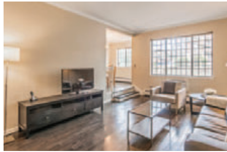
Briarwood Chatham $305,000

www.coldwellbankerhomes.com/id/33511248 Ellen Murphy 908.233.5555