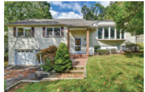
1626 Larkspur Drive Mountainside $599,000