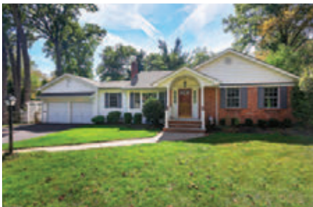
351 Raccoon Hollow Mountainside $599,900