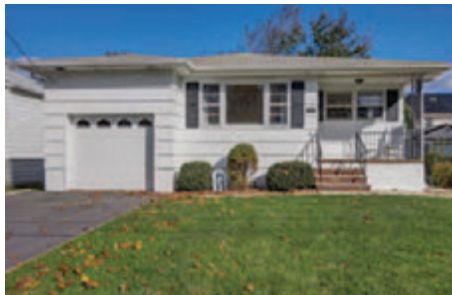
40 Harrison Street Clark $424,900

Well maintained Ranch features open kitchen / dining area, finished basement and hardwood floors. Freshly painted inside and out!