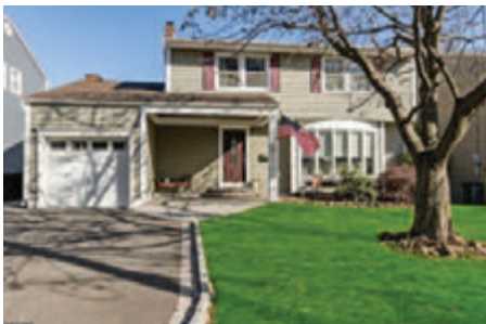
307 Montague Avenue Scotch Plains $639,000