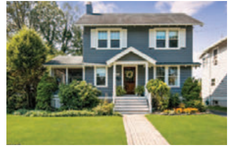
807 Embree Crescent Westfield $649,000

www.coldwellbankerhomes.com/id/33196413 Faith Maricic 908.233.5555