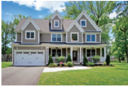
67 Westfield Road Fanwood $1,100,000

www.coldwellbankerhomes.com/id/33360479 Maria Ackerman 908.233.5555