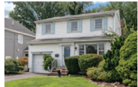
613 Hory Street Cranford $425,000

www.coldwellbankerhomes.com/id/33839059 Tamatha Costello 908.233.5555